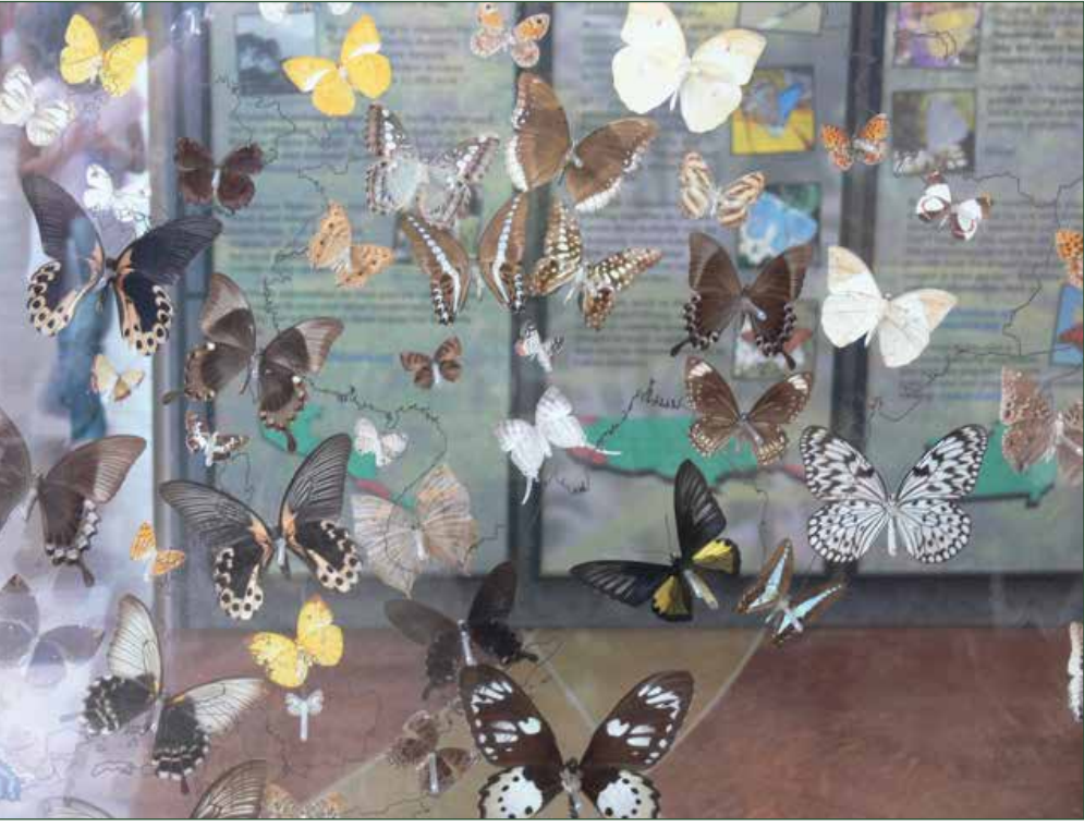
The Butterfly House in Faust Park consistently offers colorful collections of its winged favorites.

Additional after-hours events will be held on Tuesday evenings in October from 4-7 p.m.