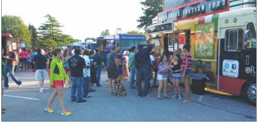
Faust Park's food truck party is scheduled Sept. 11 from 5-8 p.m.