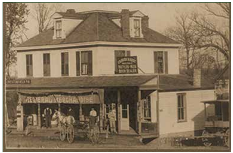
The Burkhardt General Store did a lively business back in its day.