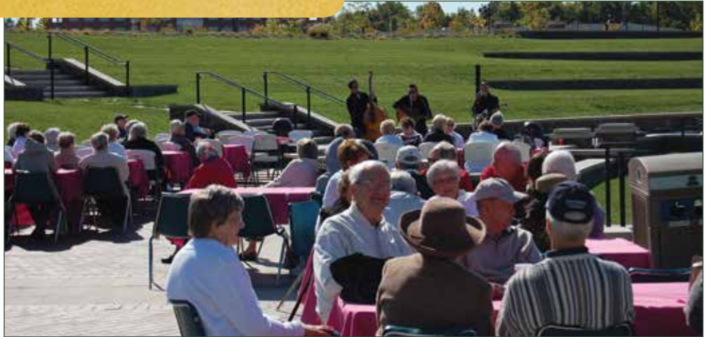
Lafayette Older Adult Program participants enjoy music before an outdoor luncheon.