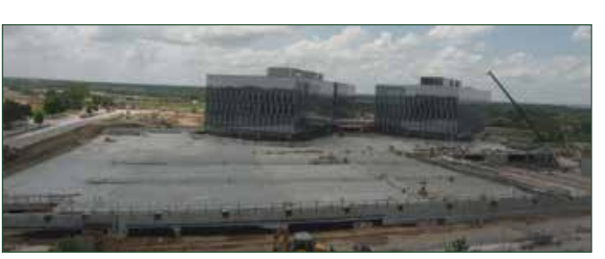
The new Reinsurance Group of America buildings near completion.

The RGA – Reinsurance Group of America – is moving its headquarters to the intersection of Chesterfield Parkway West and I-64, and the project is almost complete. The construction includes two office buildings of approximately 400,000 square feet, plus a parking garage. The buildings are scheduled to