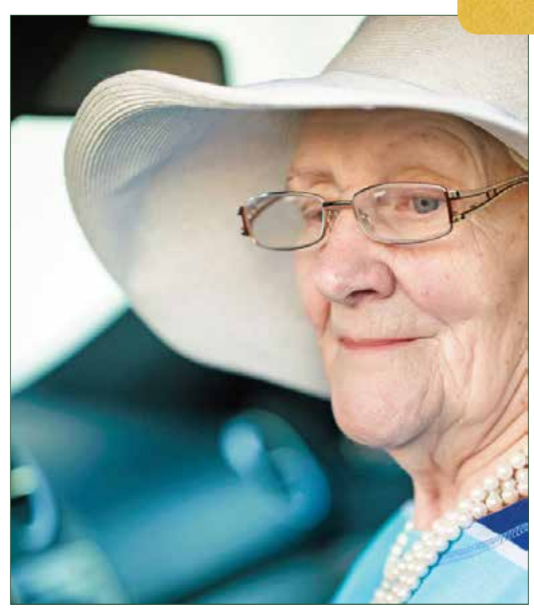
Volunteers sought to provide rides for older adults to medical appointments.

appears inside of the Parks & Recreation Fall