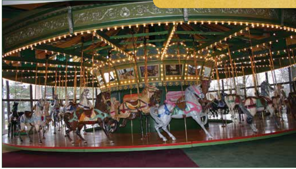
Rides on the St. Louis Carousel in Faust Park are part of many fall programs.

Saturday, Sept. 13, 10:30 a.m.-noon $15 a child Little girls dress up as princesses, make