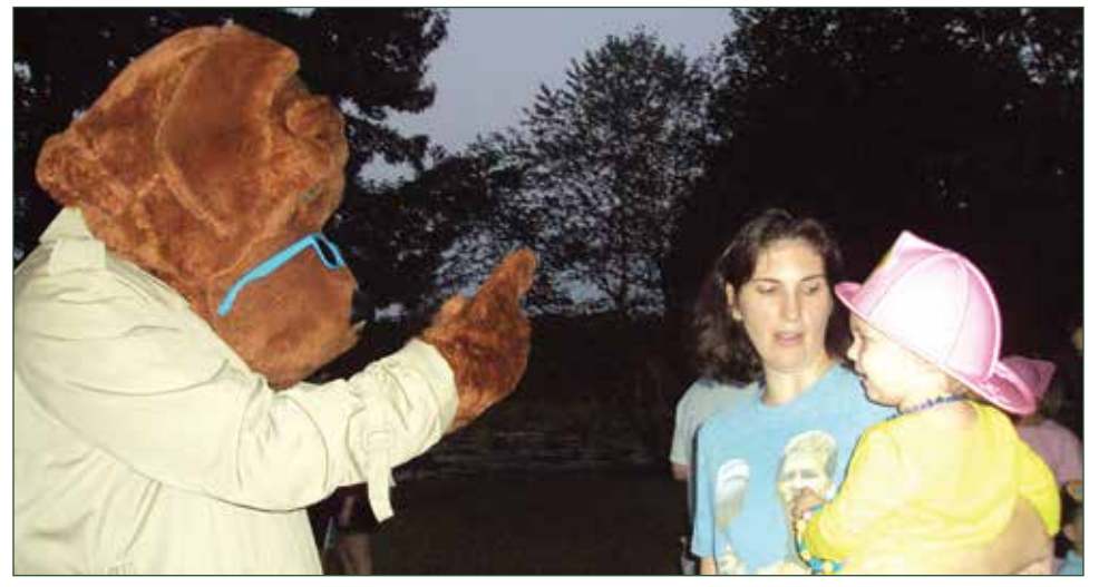
McGruff the Crime Dog makes a friend on National Night Out in Chesterfield.