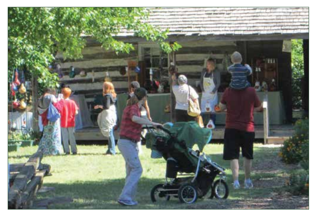
Patrons flock to the Faust Heritage Festival (above) to see demonstrations of historical techniques, such as (below) traditional spinning.