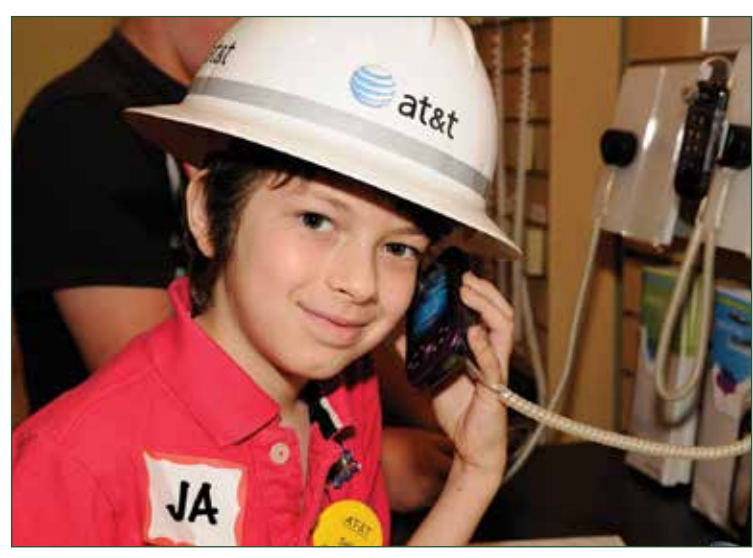
Kids receive hands-on work experience in the Junior Achievement programs. Volunteers are needed to help guide the young participants.

Junior Achievement is the largest and fastest growing nonprofit organization dedicated to economic education and entrepreneurship in the U.S.